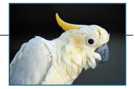
Rosemary Low The largest threat facing the Yellowcrested Cockatoo is the wild bird trade Zoom In

In doing this BirdLife joined forces with the New South Wales (Australia) Department of Environment and Climate Change (DECC), whose participation allowed the programme to be widened towards establishment of a new national protected areas